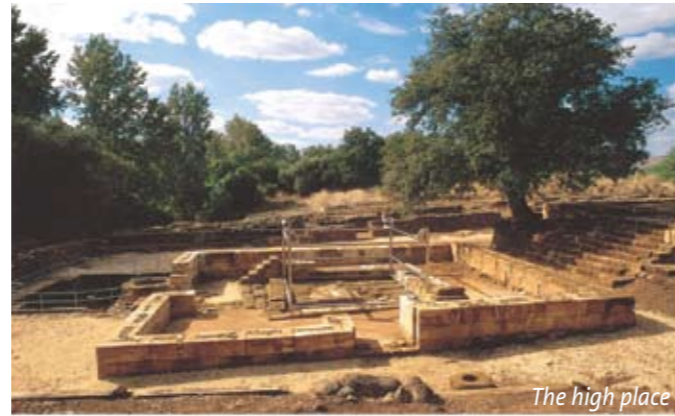
The high place

During the entire time in which this ritual site was in use, the same stones were used. The people simply added walls, stories, chambers, and courtyards, or opened up existing partitions. The altar stood in front of the large platform, surrounded by finely chiseled stones. A metal frame now indicates where the original pieces are missing. Near this area, archaeologists discovered a round reservoir from the Hellenistic period as well as animal bones. On the western side of the site, the team uncovered small altar rooms and priestly chambers, with special implements for offering incense. A Hellenistic-period wall surrounds the ritual site. Here, an inscription was found in Aramic and Greek: "to the god who is in Dan." This site was used for ritual purposes until the Roman period. From here, the trail continues to the "command-post outlook," which can be reached through the original defense trenches. The Israel Defense Forces used this post until the 1967 Six-Day War. Below is the patrol road. At the foot of the tell is a white path that is on the other side of the border with