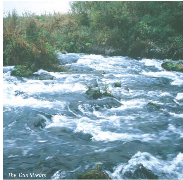
The Dan Stream

This ends the tour of ancient Dan. We recommend that you return to the parking lot via the "Garden of Eden," the flour mill, and the wading pool. The eucalyptus trees that shade the parking lot were planted by the members of Kibbutz Dan when they took possession of the land in 1939.