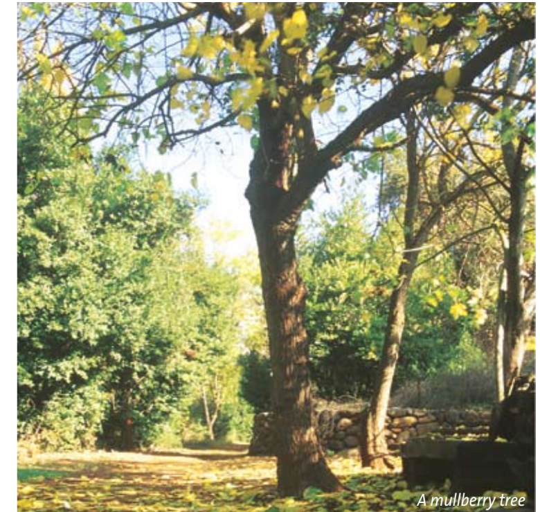
A mulberry tree