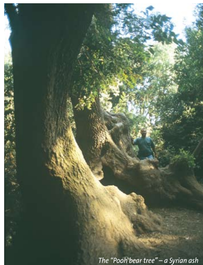
The "Pooh bear tree" – a Syrian ash

An impressive gate built of three pairs of pilasters, apparently from the First Temple period.